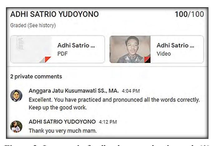
Figure 2. Lecturer's feedback on student's work (1)

The last stage (see table 3), the process of learning continues to after content that L focuses on giving feedback, assessment and enhancing retention and transfer for generalization how the knowledge can be applied on wider purpose in real life. Specifically, L gave feedback and suggestion on student's performance (volunteering performance). SS tried to get some insight from L's feedback from volunteer performance, then they complete their presentation assignment and uploaded to Google Classroom. L gave feedback to all SS' assignment.