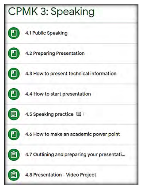
Figure 2. The course structures

As stated before, LMS used in this class is Google classroom which is officially provided by the university. Lecturer prepared the course structure of speaking activity. There are eight subdivisions for scaffold the students learning activity and those divisions are designed for a final goal-presentation project. Based on the figure 2 , the learning process can be explained as follow.