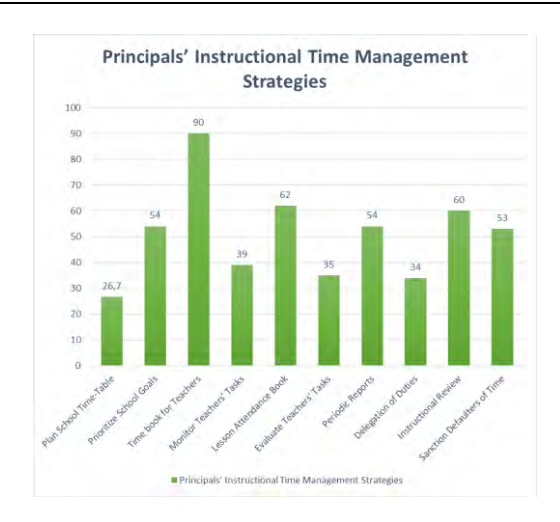
Figure 1. Principals' instructional time management strategies