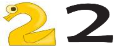
Figure 1 The Shape of the Number '2' Resembling a Duck