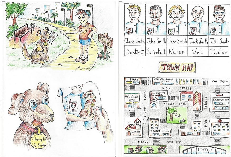
Alberto San Emeterio Bolado© (published with author's permission)