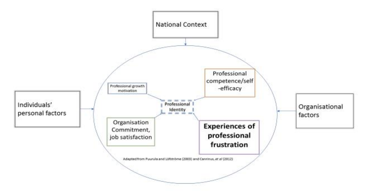
Figure 2: A refined conceptual framework

The different sizes of the text boxes convey the comparative contribution of the elements to the development of professional identity. In order of impact, these are, firstly experiences of professional frustration, professional competence/self-efficacy, and commitment to the organisation, job satisfaction and finally professional growth motivation. The research indicates that experience of professional frustration has a greater impact than the professional growth motivations of an individual to their development of professional identity. This links with the job satisfaction and commitment to the organisation, as experience of professional frustration can contribute to negative feelings towards the organisation. Professional competence/self-efficacy are in turn diluted by professional frustration. These findings also show that a reduced sense of agency is detrimental to a participant's professional identity. Accordingly, to accommodate external factors that influence the professional identity journey, both positively and negatively a further revision of the conceptual framework is necessary.