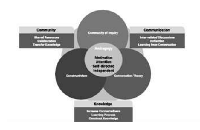
Figure 1. Theoretical framework with interlocking themes

is a gap that combines practice and theoretical concepts for blended learning. There is also a need for a theoretical understanding of blended learning as related to practice in education. Figure 1 depicts the interlocking theories that support the design, implementation, and practices of blended learning. The theoretical framework, along with a focus on community, communication, and knowledge, provides a model to frame instructional practices in higher education. The theory of constructivism, conversationalism, and community of inquiry are applied to enhance a deeper level of community and build integrated communication through reflection and discussions while leading to an increased connectedness of the content.