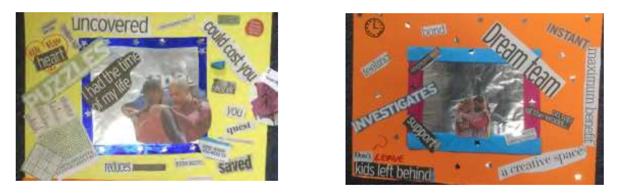
Figure 6. The teacher's perspective is on the left and the pupils' on the right.

Another metaphor included that of going on a 'journey' (Figure 7) with images ranging from footsteps, to paths, to a stair-lift going on a 'never-ending journey'. Their expressed intention was that 'the very good teacher will never stop reflecting on their practice ... if they have then they are no longer a good teacher'. This could possibly indicate a move towards the 'advanced beginner' and the increased development of thoughtful insight about their practice.