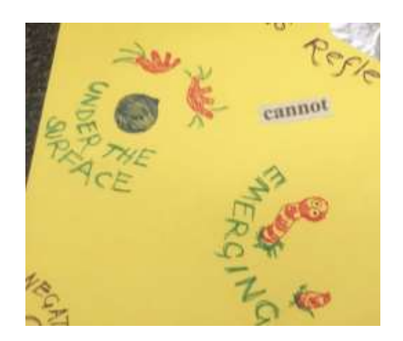
Figure 12. It's not the children's fault.