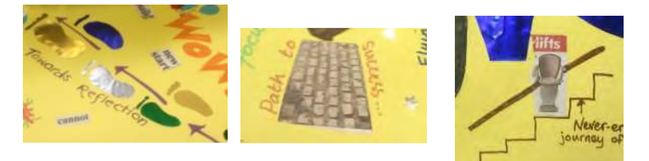
Figure 7. Extracts from collages showing a representation of a 'journey'.

Another metaphor included that of going on a 'journey' (Figure 7) with images ranging from footsteps, to paths, to a stair-lift going on a 'never-ending journey'. Their expressed intention was that 'the very good teacher will never stop reflecting on their practice ... if they have then they are no longer a good teacher'. This could possibly indicate a move towards the 'advanced beginner' and the increased development of thoughtful insight about their practice.