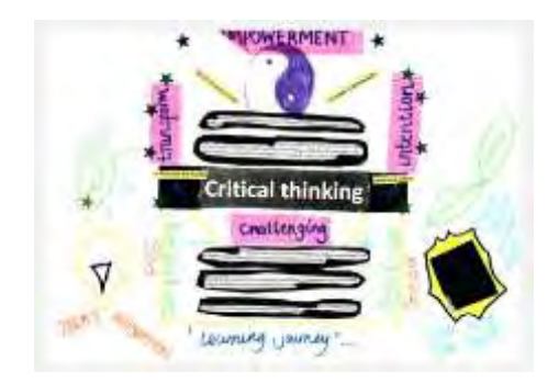
Figure 9. Collage with image of balance.