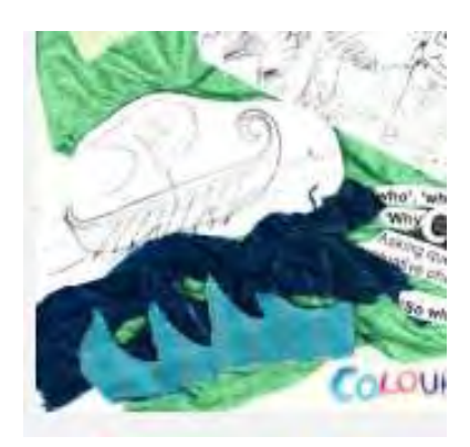
Figure 8. Collage with crumpled tissue.

However, within this more obvious metaphor, the collage process also took their thinking on more unexpected routes; for example, one trainee wanted to ensure that it was understood that her use of crumpled tissue was to indicate that critical reflection is never plain sailing (Figure 8).