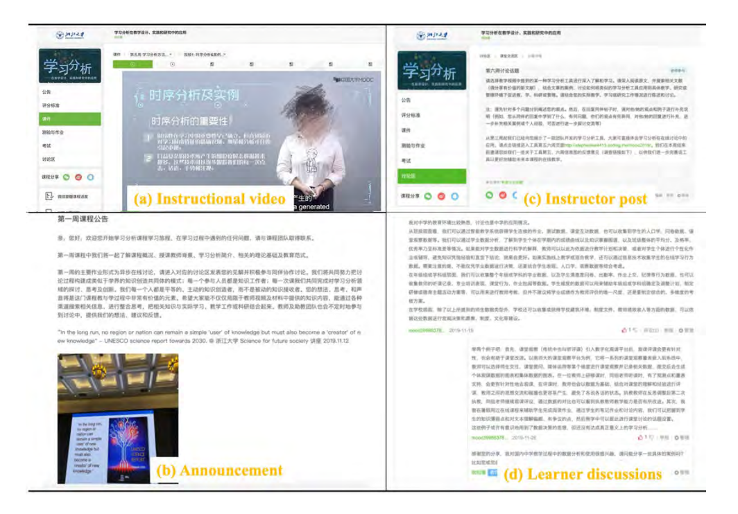
Figure 1 . The MOOC platform.

We used a combination of pedagogical strategy, a learning analytics tool, and a social learning environment to foster learner engagement in discussions. First, we used a knowledge-construction pedagogical strategy and related prompts, such as sharing and comparing information, elaborating of opinions, exploring dissonance among ideas, negotiating meanings, and synthesizing knowledge (see Figure 1). Second, from a technological perspective, we designed and devised a student-facing learning analytics tool to demonstrate learners' discussion processes with the interaction, topic, and epistemic networks (see Figure 2). The interaction network demonstrated learners' social interactions with others; the topic network demonstrated learners' use of keywords; and the epistemic network demonstrated five dimensions (i.e., concept, procedure, fact, strategy, and belief) shown by the learners in their posts. This analytics tool was hosted as a Web page and embedded in the course discussion forum. Finally, we built a social learning environment through the use of social media and MOOC forum. We used the group function of a popular Chinese social media tool named WeChat to build a self-organized community through which learners could foster a sense of belonging (see Figure 3). We also designed a social section in the forum for learners to share personal life stories or interesting topics.