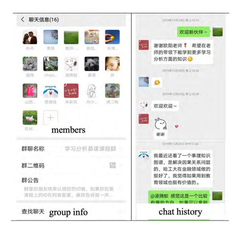
Figure 3. The WeChat group.

From "An Application of a Learning Analytics Tool in MOOC," Fan Ouyang research team, n.d. (<u>https://8jrscl.coding-pages.com/</u>). In the public domain.