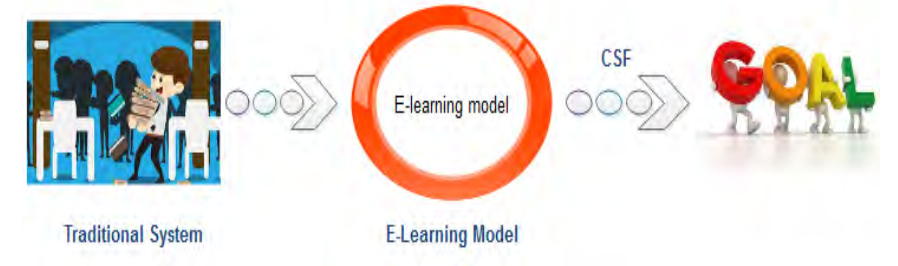
Figure 1: Typical e-learning model to achieve goal

E-learning has created new opportunities for the industry and educational institutions to adopt this latest tool for switching towards e-