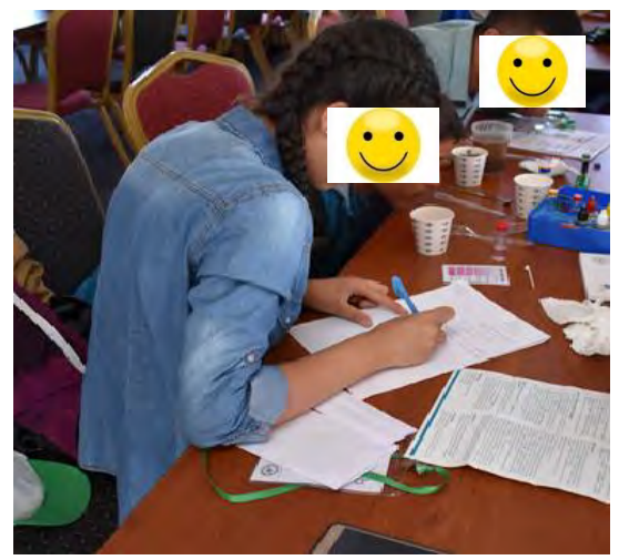
Photograph 10. The Process of Groups' Reporting Their Results

This stage was planned for 20 minutes. At this stage, students report the whole process after testing their hypotheses that they have developed for the problems (Photograph 10).