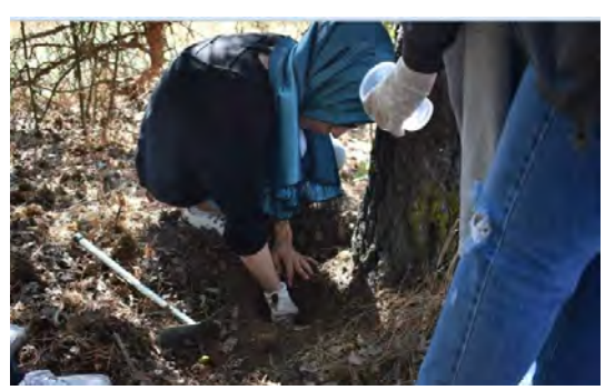
Photograph 7. The Process of Groups' Taking Samples from the Soil