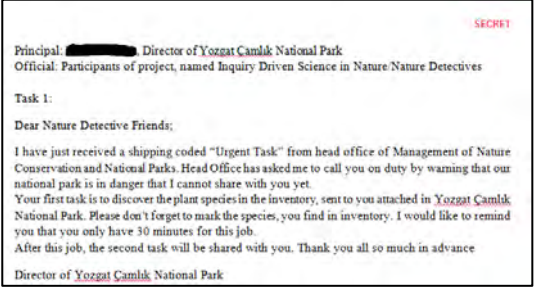
Photograph 1. The Secret Document Signed by the Director in the National Park 1

Envelopes containing a secret document (Appendix 1) signed by the director in Yozgat Çamlık National Park, is distributed to the groups of students at the first stage of the inquiry process suggested by Jussaume et al. (2006). It is presented Photograph 1. Additionally, a research kit containing the documents and materials they will need in the process is also distributed to the groups. The recommended length of time for the stage is 40 minutes.