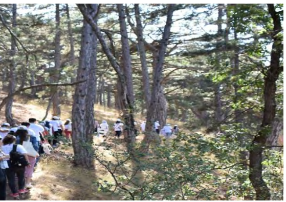
Photograph 2. Tour of Nature in Yozgat Çamlık National Park and in Fatih Nature Park

The students go on a 30-minute nature tour to identify the plants mentioned in the book entitled "The Inventory of the Flora and the Passeriformes in Yozgat Çamlık National Park and in Fatih Nature Park" (Photograph 2). They return to nature educational center with the data they collect. This stage and all other stages following it are observed by using the "Observation Control List of Inquiry Skills" given in Appendix 2.