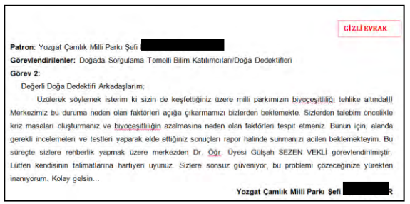
Photograph 4. The Secret Document Signed by the Chief in the National Park 2

The most frequently stated problems are chosen from the problems that the students have identified. After that, the second envelope of mission signed by the chief in Yozgat Çamlık National Park is distributed to the students (Photographs 4-5).