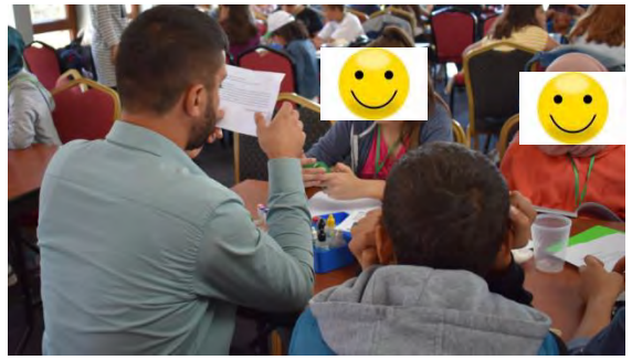
Photograph 5. The Process of Groups' Hypothesizing