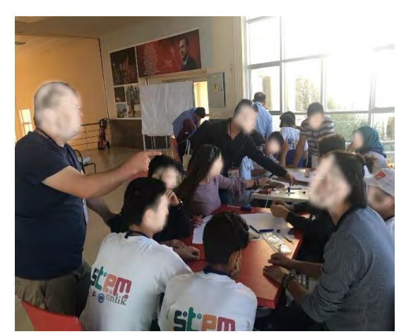
Photograph 4. Drawing Stage of Periscopes