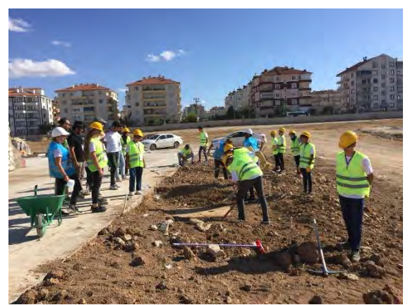
Photograph 3. Examination of Roman Tombs for Proper Periscope Selection

said: "The periscopes will be used to view the interior of the Roman tombs that you will find at the site of the excavation. So, what should be the shape of the wooden periscope to be inserted into the Roman tomb?" Upon this, one of the participants responded, "We can make it cylindrical, the periscopes I saw were all cylindrical." Another participant said, "It would be difficult to make a cylindrical periscope using wood material, I think we should make it rectangular." The instructor said "It may be easier to square off a wooden periscope. So before going into design, would you like to see where exactly to use your periscopes, which will be made of wood in the form of a rectangular prism?" The site was then surveyed and the Roman tombs, where the periscopes would be used, were examined (Photograph 3).