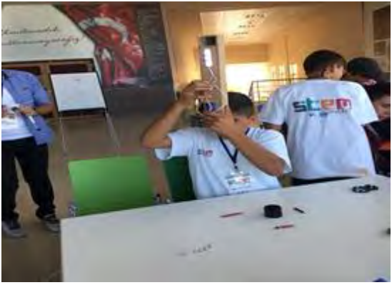
Photograph 7. Evaluation of the Periscopes

most appropriate periscope model (lengthwidth-mirror angles-integration of the light circuit) and tested it with the guidance of the instructors. In the instructor's evaluation, the following criteria for the periscopes were taken into consideration: the smoothness of the frame of the periscope (the shape of the rectangular prisms), the angles of the mirrors, the imaging power of the periscope, the mobility of the nested parts, and accurate configuration of the electrical circuit. The periscopes that met the criteria were deemed suitable to be taken to the field. Periscopes that did not meet these criteria were returned to the group and the group was asked to revise their periscope (Photograph 7).