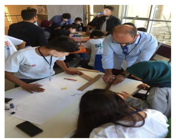
Photograph 6. Construction Phase of the Periscopes

In this context, each group combined the pieces of wood they measured and cut, using hotsilicone with the help of trainers and guides (Photograph 6). The participants then adjusted the angles of the mirrors of their periscope, in the shape of two rectangular prisms that passed into each other, together with their group mates. The participating groups tried to design the