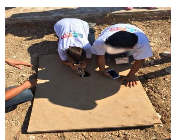
Photograph 8. Testing the Periscopes

The periscopes developed by the students were taken to Roman tombs for testing. The testing stage took an hour. Without opening the tombs, the periscopes were descended into the tombs from a small opening to identify the findings inside. The group that identified the artifacts in the most accurate way was authorized to open the tomb (Photograph 8).