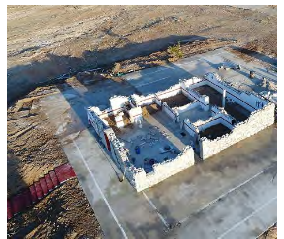
Photograph 1. Artificial Ancient Roman Villa

All project activities were planned by the project researchers. Aligned with а STEM+Archeology education approach, the activities were designed to include science, technology, engineering, mathematics, and archeology aspects. In this context. STEM+Archeology activity templates were created in the course plan suitable for the ninth grade of high school (Appendix 1). The participants were given these activity worksheets and informed about the process. Details about the activity process are presented in the following sections.