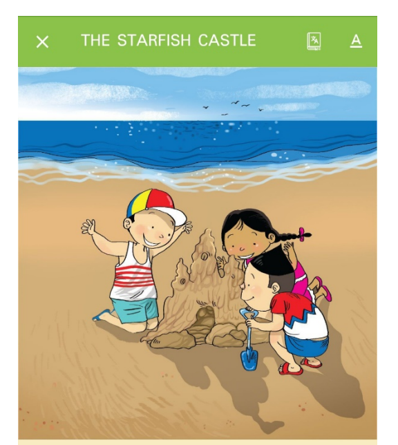
Hooray! It's done! It's the most beautiful castle in the world.