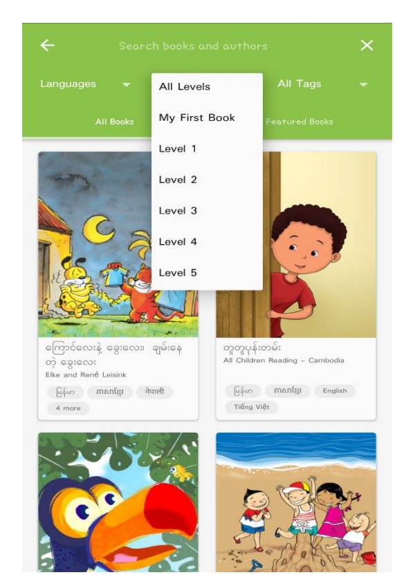
Figure 4. Level Setting