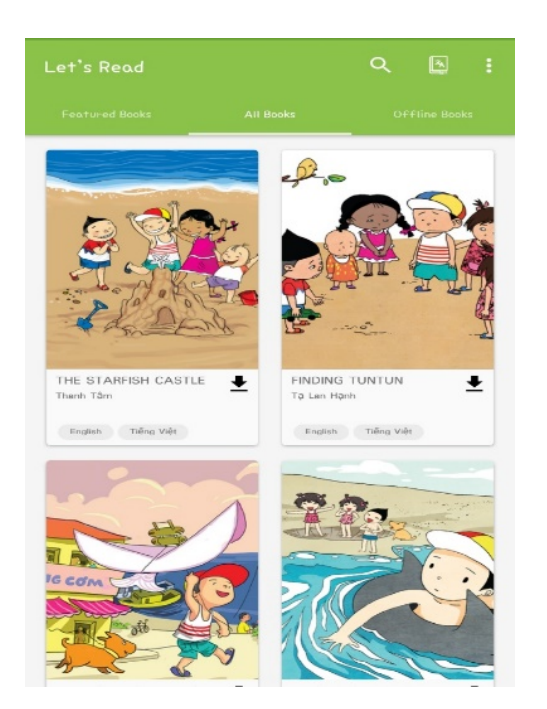
Figure 2. The Homepage