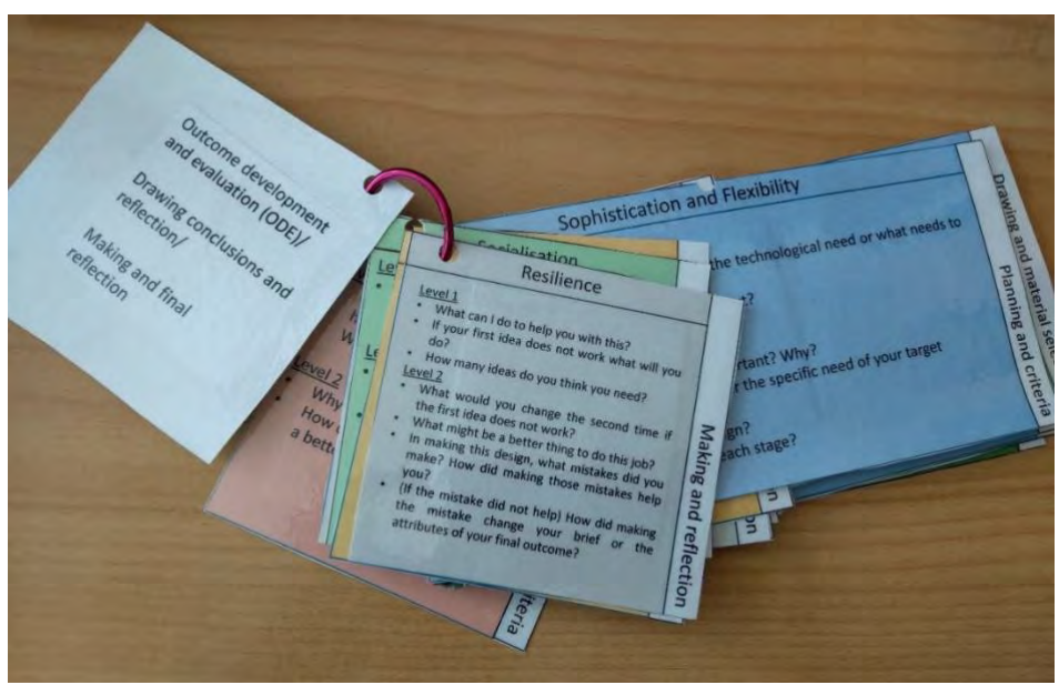
Figure 4: Iteration Round 3 ouput