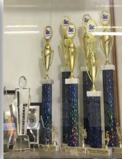
"My biggest concern is I want them [my students] to feel the success of winning their desired contest. But I am worried that all of hard work and commitment it takes to win will make me burned out." – Participant #21, Photo Caption