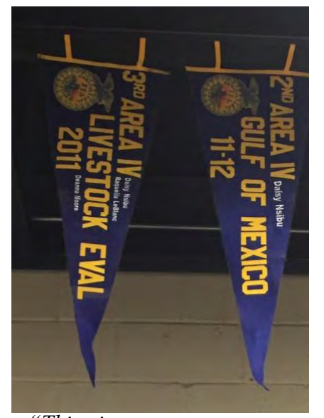
"This picture represents my concern because I am worried that I might not be competitive enough for this job. I see a lot of banners hanging on the walls of ag buildings but I am just not that competitive" — Participant #29, Photo Caption

As the students began to come to terms with feelings of incompetence regarding their lack of technical knowledge, their tensions reemerged after viewing photographs (see Figure 2) submitted by their peers that depicted success in agricultural education. As an illustration, many of the participants