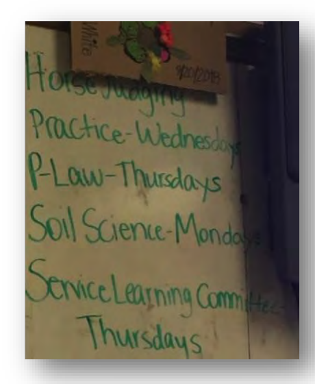
Figure 3 Photos and Captions from Participant #1, #14, and #30

This is a photo of the white board in Ms. Brown's room. It has her after school schedule. My main concern is the time it takes to ensure students are successful in similar activities. – Participant #1, Photo Caption