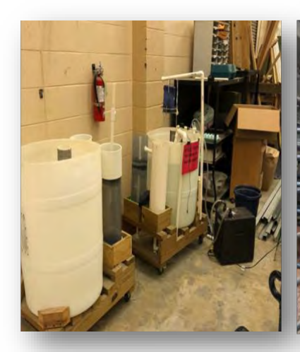
Figure 1 Photos and Captions from Participants #7, #13, and #28