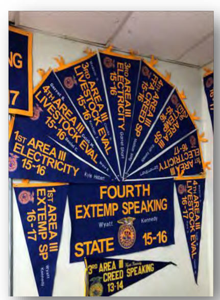
"My biggest concern is making sure students are successful. I want to make sure they are proud of their program and this is best achieved by hanging up banners. But achieving this is my biggest concern." – Participant #9, Photo Caption