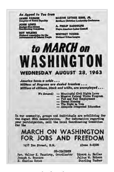
Figure 3. Example of an advertisement used in the Primary Historical Documents assignment

In my social studies methods classroom, I might give my pre-service teachers two or three primary documents written by a historical figure, such as letters or diary entries, which are alternative genres borrowed from ELAR curricula. Other times, I use items that