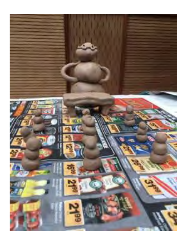
Figure 4 "Authority over" expressed through scale, glasses, hands, a table, and uniform rows

In the feedback session, one student explained: