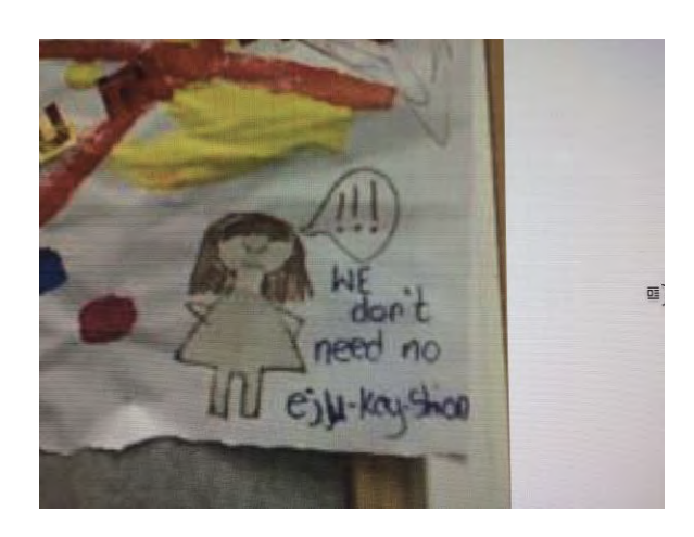
Figure 1 The small figure of the gray teacher blended into the background: "We don't need no ejukay-shon."

Another group had made several handprints using bold colors covering the entire poster. One student wrote: