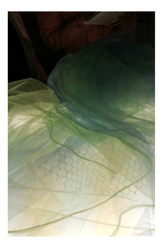
Figure 6 Sympoietic relationality

equal. Just as a circle is equal at any given point in its circumference.