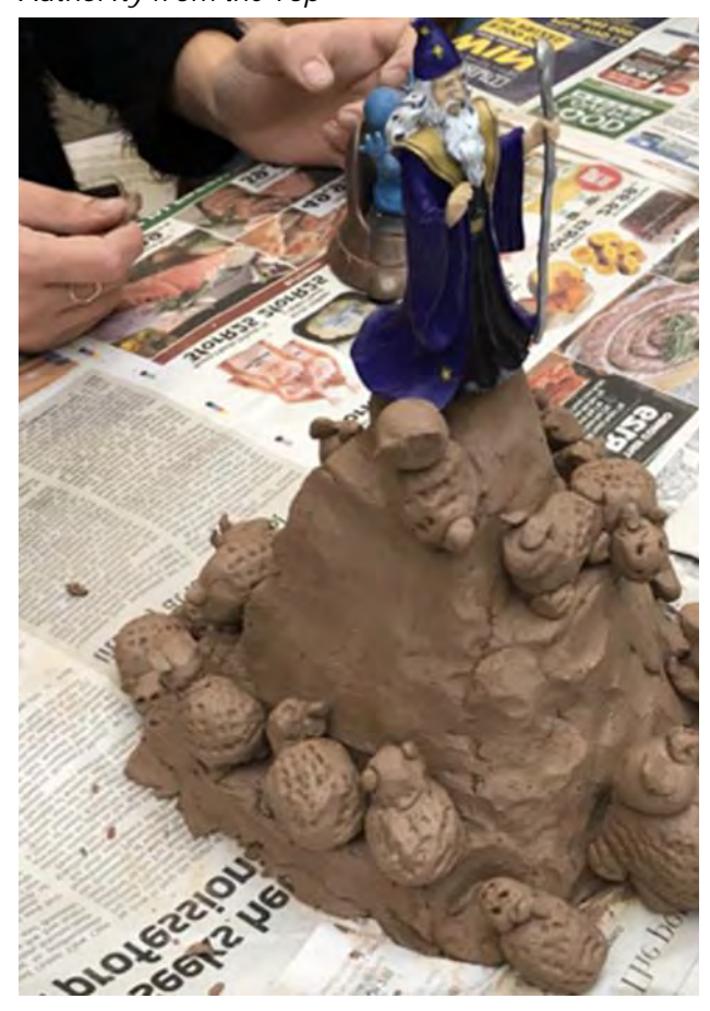
Figure 2 Gandalf, a Teacher Exercising Traditional Authority from the Top

The narrative character of Gandalf from Tolkien's The Lord of the Rings appealed to quite a few students as they intra-acted with clay, a copy of the text, newspaper, each other, etc.: