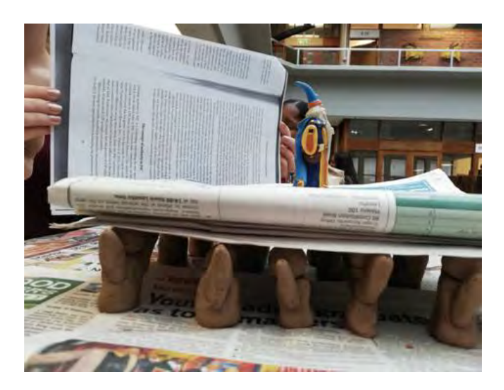
Figure 3 Clay students elevate the teacher by means of knowledgetexts

The idea of traditional authority is emphasized in the second sculpture (Figure 3) through the clay figure by elevating the teacher using a newspaper. One student explains: