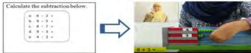
Figure 2 CwD can use Abacus Numbers to add/subtract two Integers