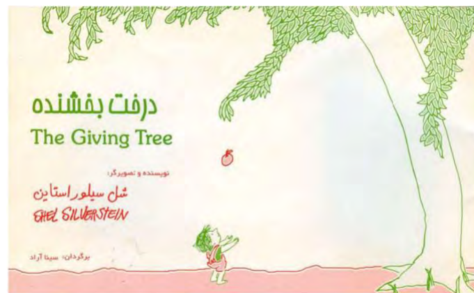
Figure 2. The Giving Tree by Shel Silverstein in Arabic and English

Children who learn to read in more than one language early on has cognitive and linguistic advantages compared to monolingual peers. As reported by Bialystok (1997, 2001), children familiar with print and story in two languages are capable of grasping the arbitrary connection between the print and the meaning. Exposure to multiple languages mediates appreciation of linguistic and cultural varieties. Literacy proficiency in the mother tongue is the indicator of a strong development of biliteracy skills, thus, children who gain more literacy skills in their home language are likely to learn to read in the target language with more success (August & Shanahan, 2006). The take-home message from the reported cases of success in the target language reading when home language literacy skills are supported could provide Syrian refugee children with chances of improving their reading and writing skills in Arabic and Turkish. The materials and instructional practices at TECs are not reported in this study. Even though Arabic textbooks prepared for native Turkish pupils are available on EBA- the official online platform of Turkey's MONE- there has been no study or project that prepares educational materials specifically for Syrian minority children other than Uyum Projesi- Compliance Project- by Directorate of Immigration Affairs materials targeting at Turkish and Syrian children. In this project, short storybooks, coloring pages, stories of appreciation were included (See Figure 2).