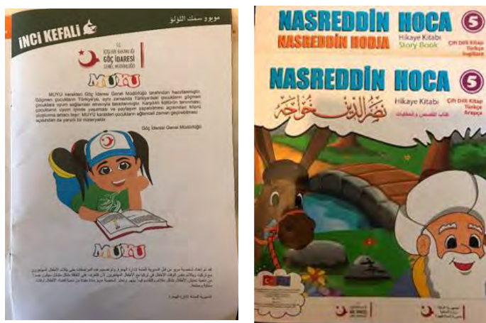
Figure 3. Materials by Turkey's General Directorate of Immigration Affairs

a) School Resources: Multiliteracies, multiculturalism celebrated, appreciated, and encouraged in the school context via culturally diverse displays, heritage language recognition and integration to education, culturally-related books in which native culture and history are a few of educational resources to ensure multilingual and multicultural literacy development. Dual language books , written in two (possibly more) languages can act as a major bridge connecting home to school. Language minority students could make the best out of the dual language book if it is written from the home language and culture perspective (See Figure 2). Occasionally, dual books have an Anglo-centric perspective and translated to minority languages (see Figure 3) without focusing on mutual values. Syrian refugee children, with the help of dual language books, could do leisurely reading with parents and family at home or could read the story, discuss and complete follow-up activities with Turkish and Syrian classmates at school.