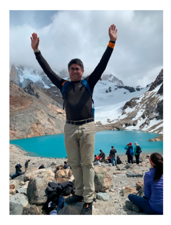
Figure 5. Laguna de los Tres, Senda al Fitz Roy, El Chaltén, Argentina (December 2019).

This was Argentinian culture at its best. Cheerful and somewhat loud socializing. Indeed, it was a memorable trip on Boxing Day 2019.