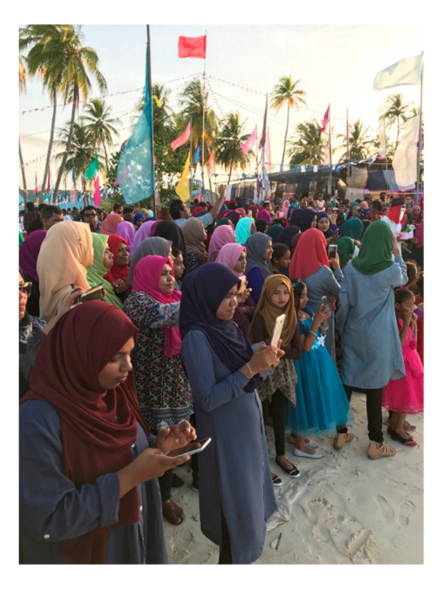
Figure 1. Technology, smartphones, and selfies: noticing what is supposedly different or perhaps similar between different national cultures [6] (p. 856). Reproduced with permission.

Oito [7] is an author of another example of how autoethnography communicates emotions, specifically regarding whiteness, namely in a classroom in the United States. The article asks if teachers are prepared to be confronted by black youths in urban classrooms, detailing "the psychic pain that racism inflicts upon the racially othered children and youths who navigate urban classrooms under the scorching glare of whiteness" [7]. Only someone in a room "stuck in stillness" [7] (p. 251) may speak of glares and of "the loudness of the loaded silence" [7] (p. 251). Such vocabulary is often absent from academic discourse and "in the name of science" we are encouraged to be formal and distant. Yet is it not academia's purpose to educate both the younger as well as older generations, aiming for change and for development, aiming to reach out? How can we reach out and touch souls if we cannot use the full force of emotion derived from our words and experiences?