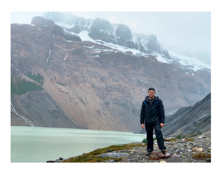
Figure 6. Laguna del Diablo in El Chaltén, Argentina (December 2019).

Our last trek in El Chaltén was to Laguna del Diablo (Figure 6) and it was a difficult one. Although it was just under 17 km, we trekked in heavy rain in the woods on uneven ground that sloped uphill and upriver. We had to climb over roots and across wet areas. I was thankful that I had waterproof trekking shoes. However, not all of our group was so lucky. Having wet socks was unpleasant and not everyone packed waterproof trousers.