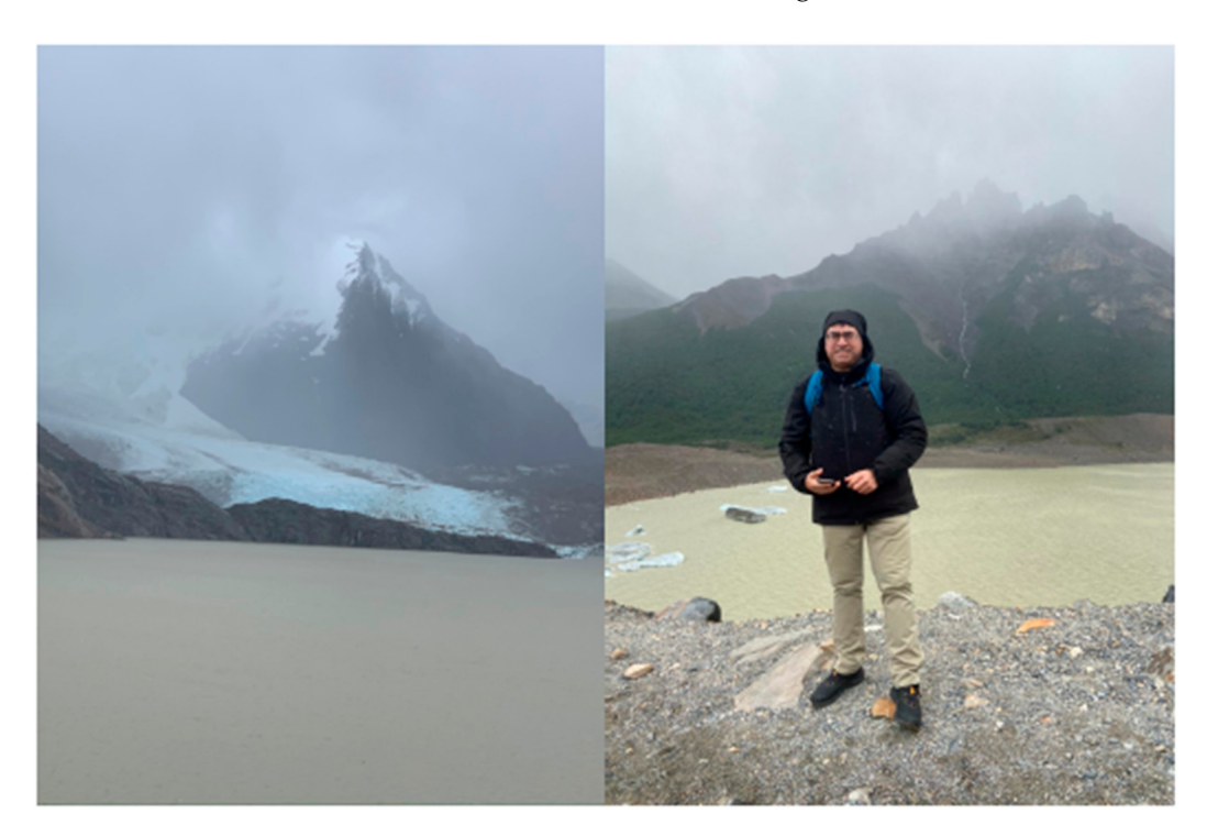
Figure 3. Arriving at Laguna Torre in bad weather. El Chaltén, Argentina (December 2019).

The 20-km trek to Laguna Torre had been a hard one. It was Christmas day (25th of December 2019) and perhaps we should have stayed at home and kept warm and dry. The rain at the top of the mountain (Figure 3) came down sideways in torrents, due to the wind. We were soaking wet and had to trek another three hours down the same route which had brought us to the summit.