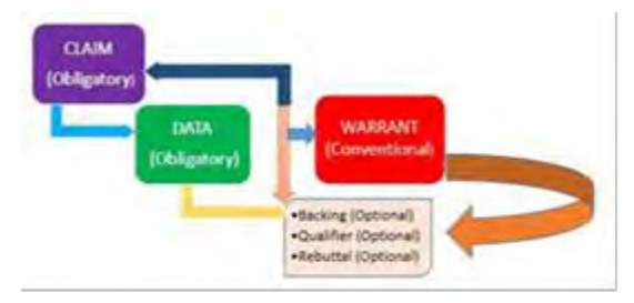
Figure 4: The Structure of Strong Argument Structure

From the example above, claim and data are used as the element of the argument. Claim is shown from the presence of the sentence "education has a complementary role to play" the author attempt to convey the claim of fact proven by the following data after the claim. It consists of telling details shown by the words "firstly, secondly" and example shown by the words "for instance" . This structure is indicated as the simplest structure where the author only put a claim and relevant justification regarding to the topic given.