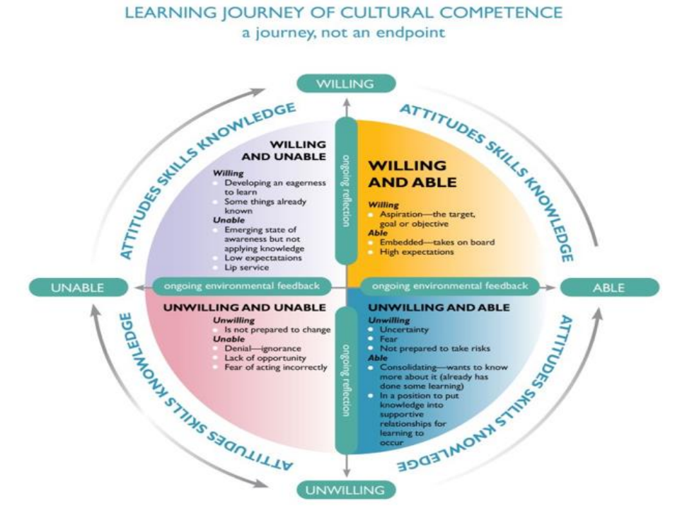
Figure 1 - Educators Guide to the Early Years Learning Framework (DEEWR, 2010, p.26)

In the context of this research we draw on the typology used in the Educator's Guide to the Early Years Learning Framework for Australia (DEEWR, 2010). This typology, developed to support Australian educators to become culturally competent (reforming), provides a useful framework for our later discussion of findings. The model's four quadrants depict educators at various stages of cultural competence. Whilst we argue that cultural competence must be taken further to embrace cultural responsiveness (transforming) (DEEWR, 2010) we nonetheless utilise this model as a tool for discussing the journey of educators from conforming curriculum (Pink Floyd) to transforming curriculum (Pink Hill).