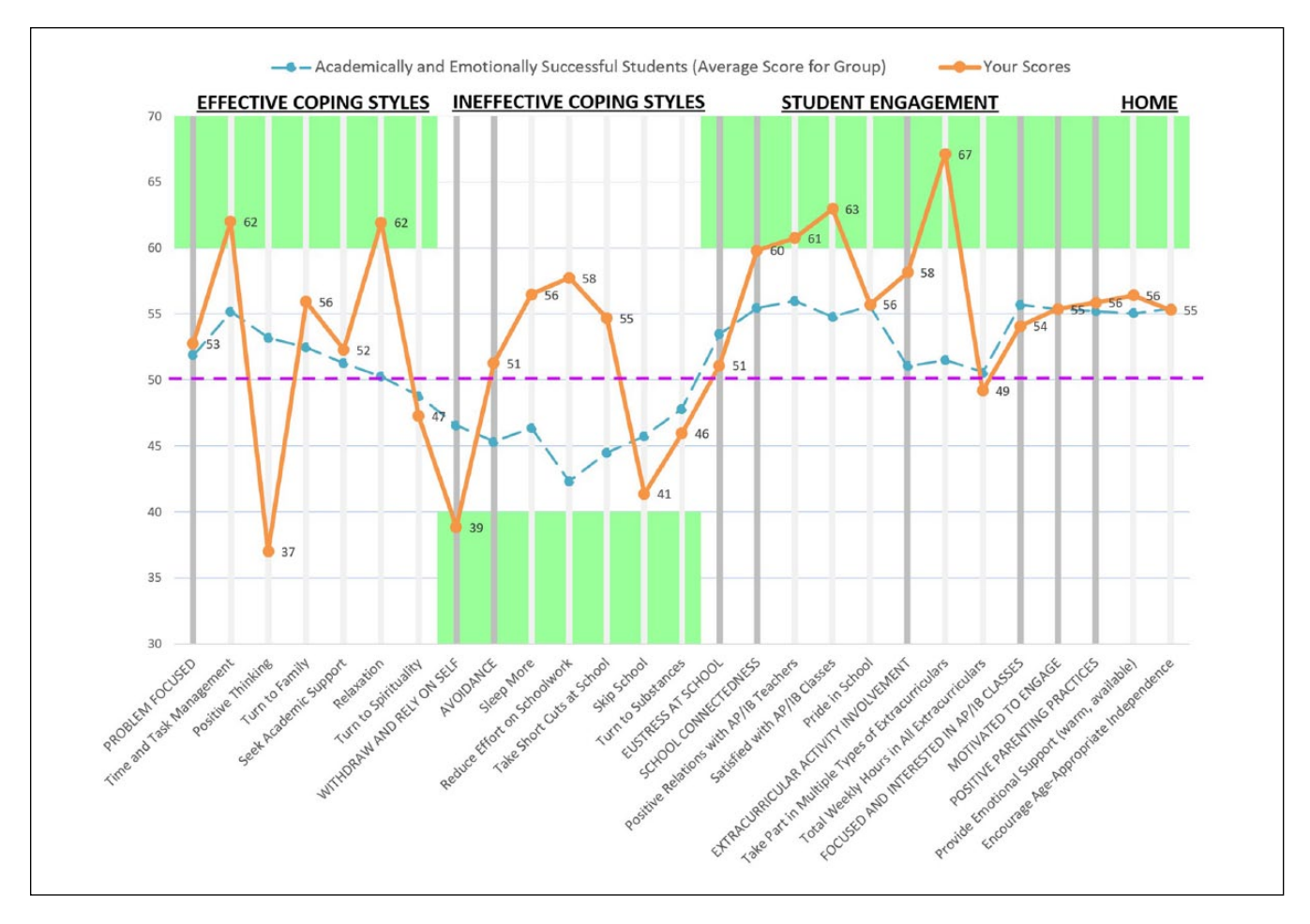
Figure 1. Example individualized score report.

1 (Engage) the student shared their values (e.g., family, friendships, education), strengths (e.g., creativity, honesty, humor), and long-term goals (e.g., graduate high school, go to college, begin preferred career). After establishing rapport, the MAP coach moved to Stage 2 (Focus) where the coach guided the student through a graphical display of their levels of coping and engagement in relation to a normative sample (Figure 1) from the pre-MAP assessment. Then, using OARS, the coach encouraged the student to identify relative strengths and weaknesses on the factors associated with success among AP/IB students (e.g., effective coping strategies, student engagement, aspects of one's home environment). After a target area was selected by the student, the coach moved to Stage 3 (Evoke), which allowed the student to voice their reasons for making a change in a specific area that they perceived were critical to their success. The MAP meeting concluded with the creation of an action plan that summarized the steps the student planned to take to reach their short-term goal (Stage 4: Plan). At the end of the meeting, the coach made a copy of the action plan for the student and asked if they would like to meet again in a month as follow-up support toward progress on their goal.