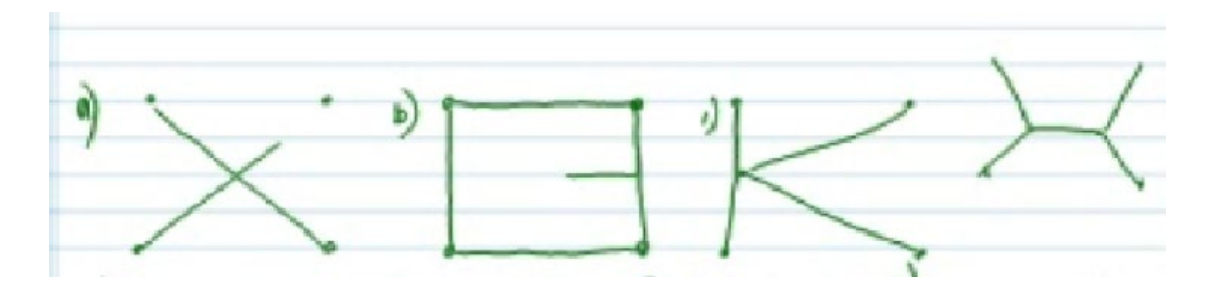
Figure 1. Four solution drafts to the problem task, the optimal solution furthest on the right. A capture from a Smartpen recording on a student in Joanne's class.

The researchers instructed the teachers to guide the students during the problemsolving process by supporting them and posing questions on the process but not giving hints on the optimal solution. During the session, all teachers roamed in the classroom and offered scaffolding to one group at a time. Joanne gave more wholeclass instructions during the collaborative phase than Fred or Lily. Additionally, Joanne and Lily instructed their students to move in the class to observe the solutions of other collaboration groups.