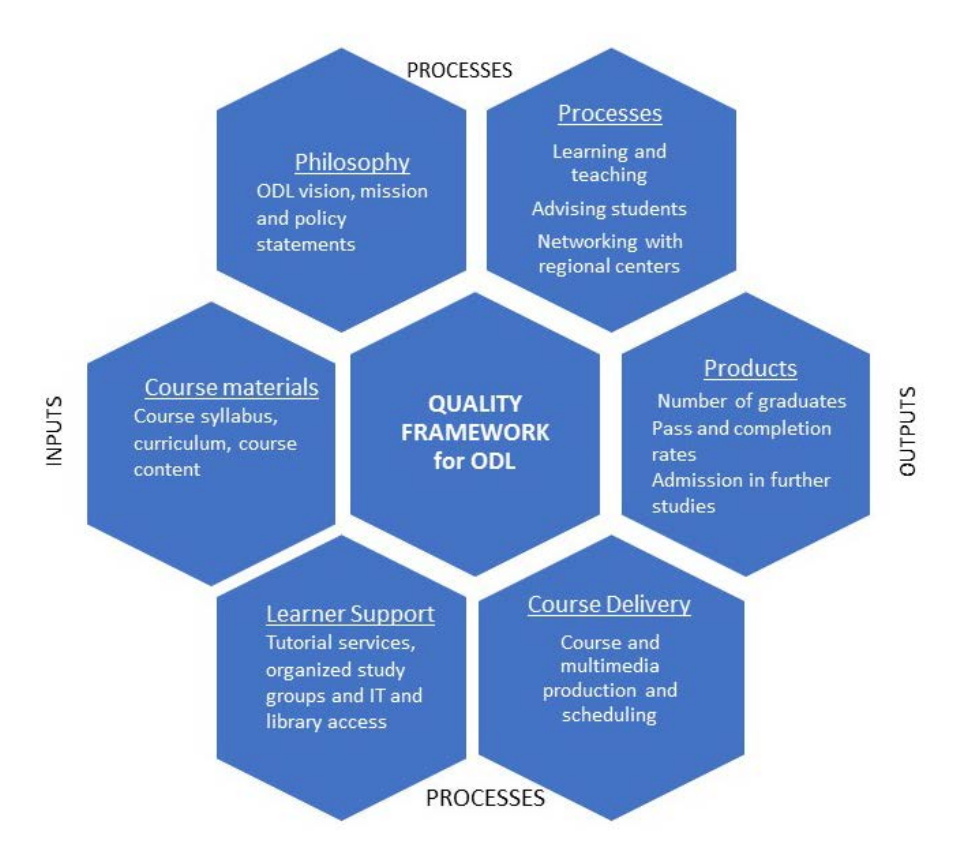
Figure 1. Quality assurance framework for ODL. Adapted from Quality assurance in open and distance learning: Trainers' kit 005 (p. 82), by COL & ADB, 1999, Vancouver: COL. Copyright 1999 by Commonwealth of Learning.

The evolution of OUs and the diverse ways they attempt to address quality gives rise to multiple questions: