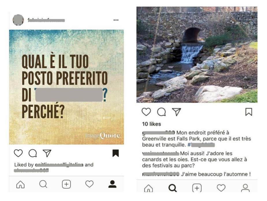
Figure 1. Example of questions prompted by the instructor (What is your favorite place in your city? Why?) and of students' posts and comments.

thematic unit, "a single thought unit or idea unit that conveys a single item of information extracted from a segment of content" (Budd & Donohue, 1967, p. 34, as quoted by Rourke et al., 2001) and a syntactical unit, "one independent clause and the dependent clauses (if any) syntactically related to it" (O'Donnell, 1974, p. 102). We calculated the social presence density of each group in relation to each indicator by adding the raw number of instances and dividing them by the total number of words in the captions and comments (we counted each emoji or string of emojis as one word). Then, we multiplied this figure by 1,000 and calculated the mean density of each category (i.e., affective, interactive, cohesive) as well as the aggregate social presence density of each group.