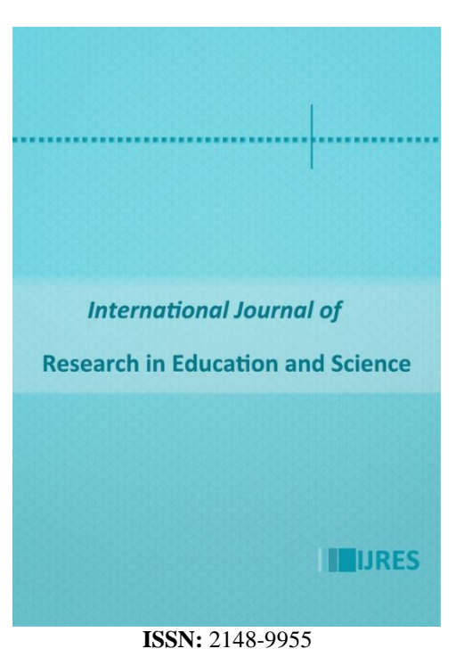
International Journal of Research in Education and Science (IJRES)