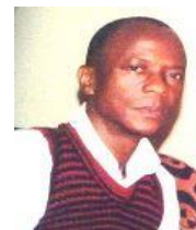
(+ Corresponding author)