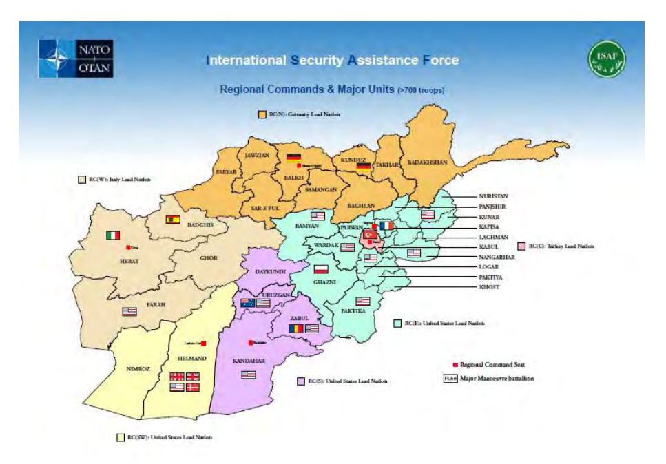
Figure 3. NATO Afghanistan Regional Commands.

The current model is limited in that if a teacher candidate attends TTC in a province, he or she must teach in that same province. Although there are national incentive programs to encourage the dispersion of teachers, it appears that this is the current state in Afghanistan. However, as security in the country improves, freedom of movement should follow (Dressler, 2011), and we should expect teachers to move across provinces. The resulting set of excursions relaxes the geographic constraint from provincial to regional using the NATO regional command areas. This was used under the assumption that NATO had conducted research into the geographic regions of the country and the resultant spatially based regional commands are accurate depictions of potential state relations (US Department of Defense, 2011). This relaxation is visually depicted in Figure 3 which shows all 34 Afghan provinces which was the original constraint. The color coding on the map aggregates the provinces into five grouping.