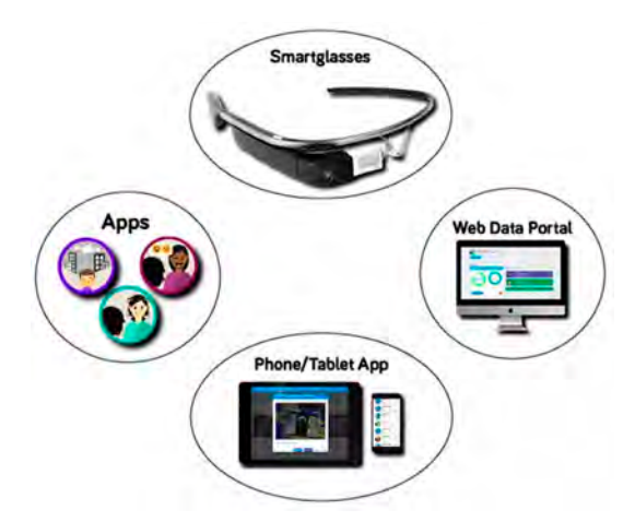
Figure 1. The Empowered Brain platform. The Empowered Brain is a digital platform and includes apps that run on smartglasses such as Google Glass, companion apps that run on a phone or tablet and are used by the facilitator not wearing the smartglasses, and a web data portal for documentation and analysis of user learning and progress.

Brain, the facilitator prompts the user to engage in a conversation about educational topics, such as for example their current assignment, homework, and academic progress. The Empowered Brain monitors and stores data regarding the user's interaction with the facilitator, calculating the user's performance using sensors that monitor the user's interaction with the outside world, including the user's gaze, head movements, eye blink, and audio. The collected information is available for real-time review through a password-protected web portal.