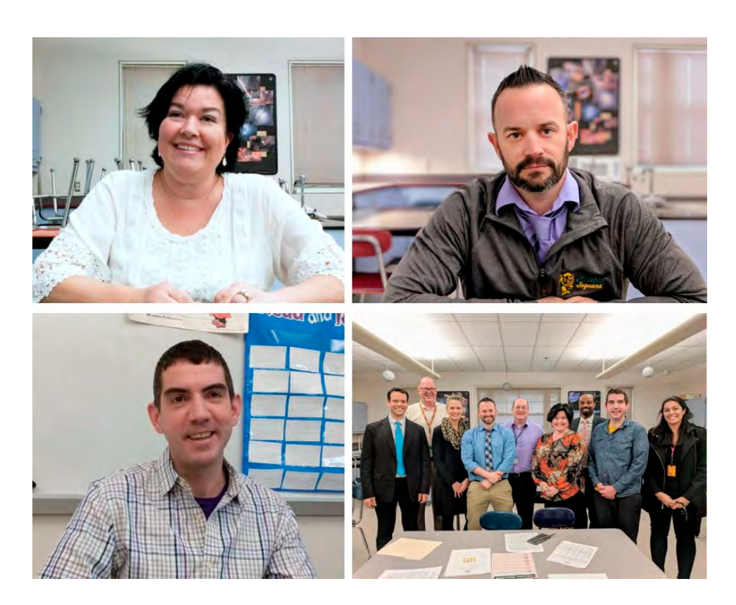
Figure 2. A diverse range of educators were involved in this study, and included a special education teacher, a general education teacher, and a paraprofessional. The study authors provided a training program to the educators to familiarize them with the technology and the intervention. Consent has been obtained for images to be published in a publicly accessible research publication.