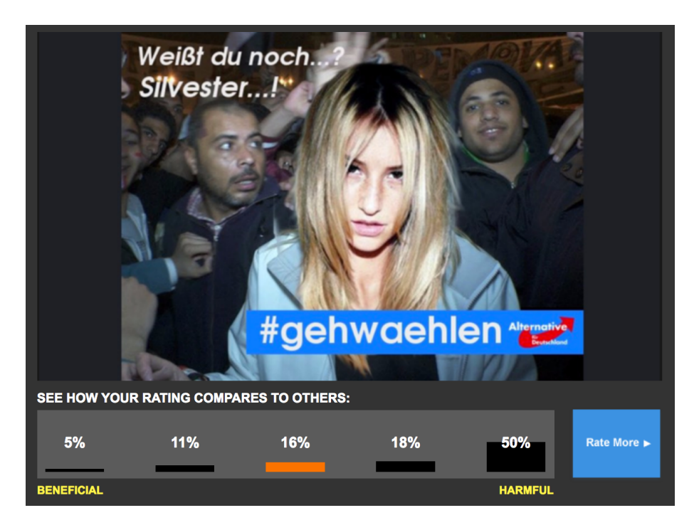
Figure 1. German propaganda artifact shown with crowdsourced rating from Mind Over Media

Students were asked to select examples of international propaganda from the digital platform Mind Over Media and offer a comment and a rating, judging whether they perceived a specific example to be beneficial or harmful. After users offer a judgment, the digital learning platform displays the results of all users who have rated the particular example, enabling users to compare their judgment to others. Figure 1 shows an example of a German political meme that was uploaded to the website. The individual who uploaded the artifact notes that the picture was found online on Facebook and Twitter and "posted by a member of the German right wing populist party AfD in the context of the parliamentary elections for the Bundestag in 2017. This propaganda piece activates emotions since it is clearly supposed to evoke memories from New Year's Eve 2015 in Cologne, where a group of male migrants attacked and harassed numerous women. Media coverage proved that this picture is fake."