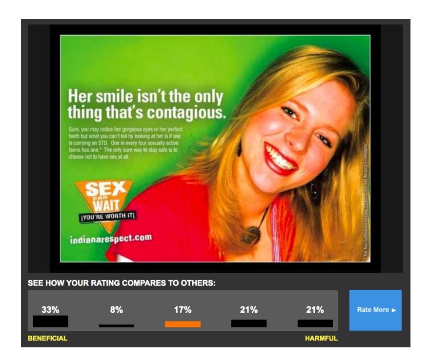
Figure 2. American propaganda artifact shown with crowdsourced rating from Mind Over Media