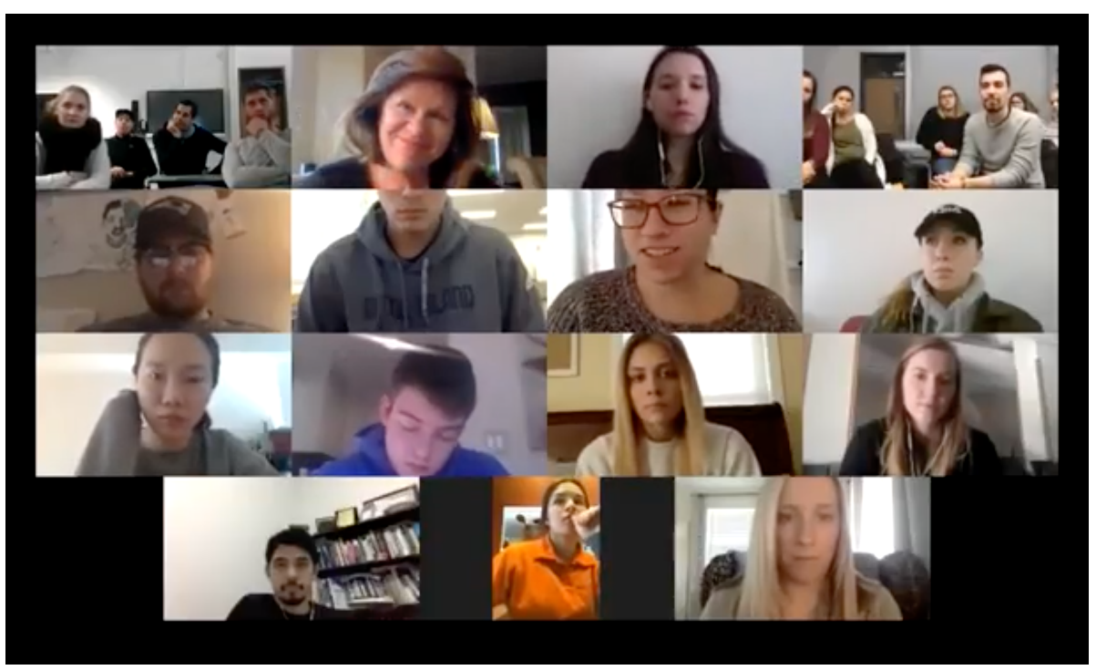
Figure 4. Virtual exchange learning experience on the Zoom videoconference platform

In small synchronous discussion groups, students were asked to compare and contrast the two political campaign videos. Figure 4 displays an image from the recorded video conference. For about half of the session, students worked in small groups, which enabled them to have a dialogue with three to six individuals, ensuring that all voices could be heard. In their dialogues, they identified many content-related similarities in the German and American political campaign propaganda. The students recognized that the Trump ad and the AfD ad both blamed the leaders of the past for their failed policies. They recognized that both ads urged viewers to be fearful of immigrants and refugees, playing upon fears in order to attract insecure voters. Both groups recognized the use of color, music, and other formal features to attract and hold attention. One student said, "We found that both videos address fears ...about losing identity, losing control over their borders, losing importance...both videos suggest that the main reason for the problem is that established politicians...didn't really care about the people".