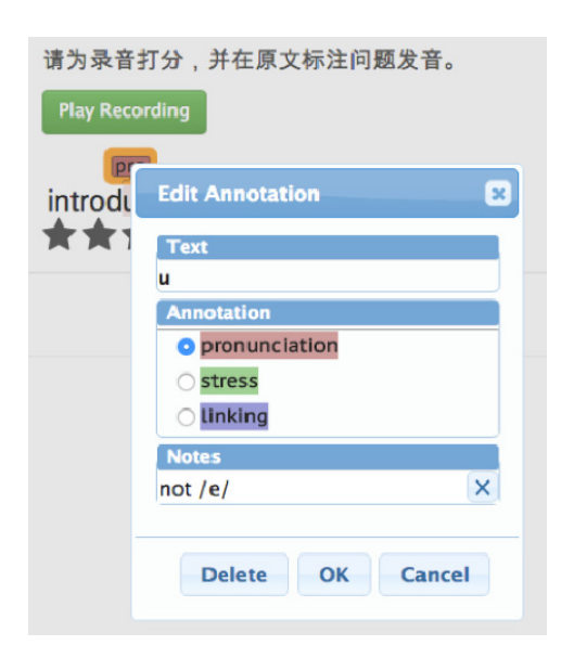
Figure 1. Web-based interface for peer assessment of pronunciation

Multimodal labeling interface. We built the interface on a browser (shown in Figure. 1) to make it immediately accessible to potentially geographically dispersed users and utilize the existing web architecture. Currently there are few existing tools suitable for peer assessment of EFL pronunciation. The ones that have been used in previous studies (e.g. the Blackboard system) have been found to be inflexible and difficult to use, lacking in the crucial functionalities necessary for efficiently performing the peer assessment task.