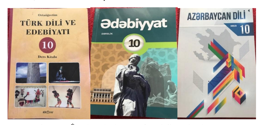
Figure 1. 10<sup>th</sup> grade textbook covers of Azerbaijan and Turkey

As seen in literature book, inside of the 10<sup>th</sup> grade Azerbaijan Language book there is also a photo of Haydar Aliyev and script of Azerbaijan national anthem. Language textbook is thin and has a colored carton cover, the book has 208 white pages which are all tearable. After the table of contents there is an introduction for the book. Later a conceptual map photo is put and text analysis stages are illustrated below different headings. At the end of the book there is a dictionary, full names of the people whose names were abbreviated in the book and a bibliography. On the final cover page the name list of authors, redactors and editors is presented.