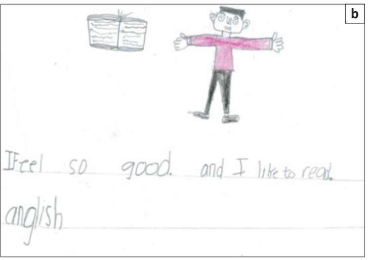
FIGURE 4: Imagined identies as readers: (a) I feel content when I read an isiXhosa book and (b) I feel so good and I like to read English.