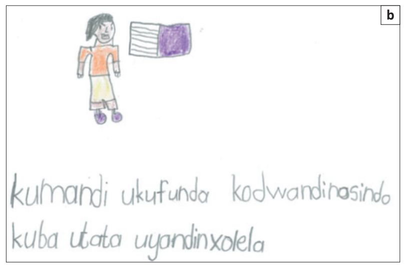
FIGURE 5: Love—hate relationship towards reading: (a) I do not want to read folktales and (b) reading is enjoyable, but I am angry because my father shouts at me.