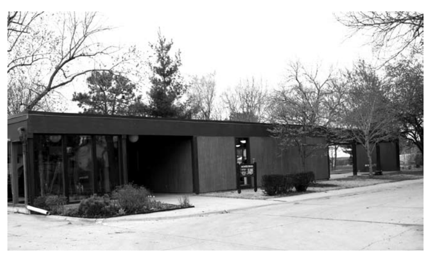
Lincoln Montessori School, Lincoln, Nebraska