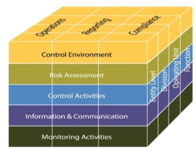
Figure 1. COSO Cube

The COSO Internal Control Model has initially been used by the private sector and for management practices in financial areas but has since been expanded to cover all sectors and all activities [26].