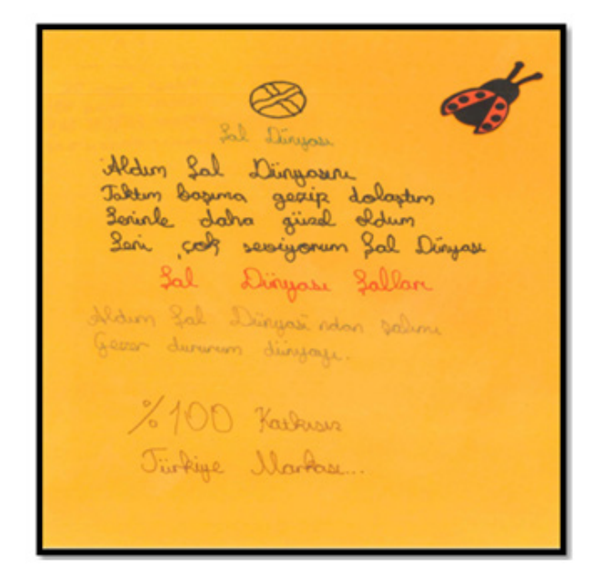
Figure 2. Second group activity sheet

Group 2 chose fabric as its product for the activity and designed their poster and film accordingly. The experts evaluated the advertising poster that the students prepared on the basis of the 5 categories mentioned in the scoring instructions. At the end of the evaluation, the group's mean score was calculated to be 7.67 and the project was found to be at a poor level. The advertising poster prepared by Group 2 for the "Product Marketing Activity" for the unit on Our Country and the World can be seen below.