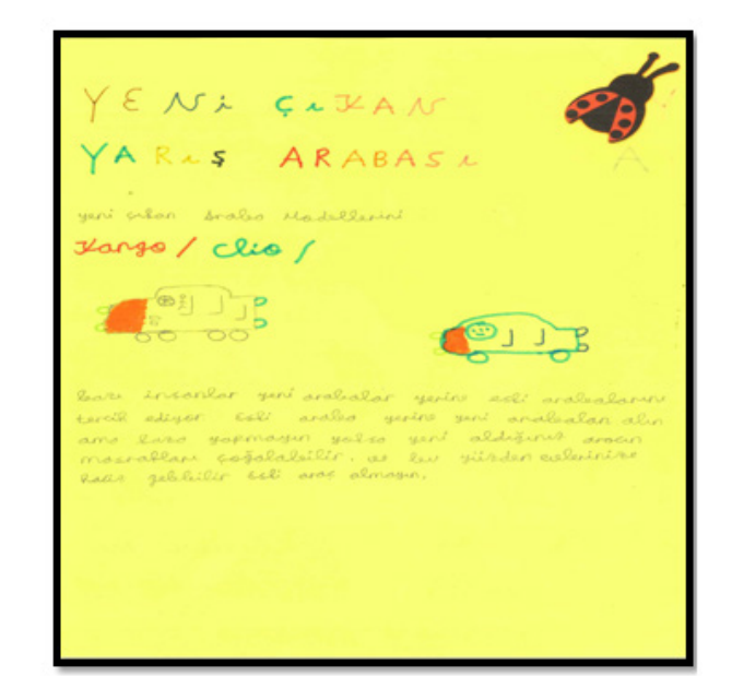
Figure 4. Eighth group activity sheet

Group 8 chose automobiles as its product for the activity and designed their poster and film accordingly. The experts evaluated the advertising poster that the students prepared on the basis of the dimensions mentioned in the scoring instructions. At the end of the evaluation, the group's mean score was calculated to be 6.37 and the project was found to be at a poor level. The advertising poster prepared by Group 8 for the "Product Marketing Activity" for the unit on Our Country and the World can be seen below.