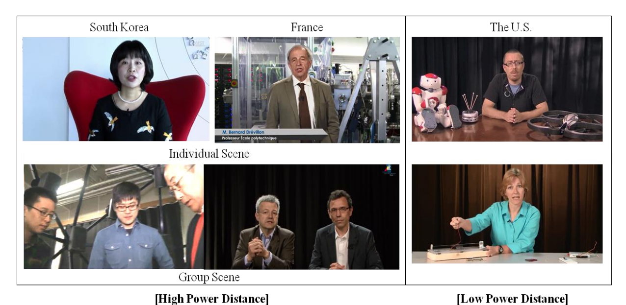
Figure 1. Example of high power distance and low power distance.

Interestingly, all videos, as shown in Figure 1, reveal features of HPD: the focus on one individual, professional dress code, and formal pose. We assumed that the contextual element of academia, that pursue professional attire to give more credibility (Lightstone, Francis, & Kocum, 2011) have influence on the presence of HPD features. Although we could find elements of HPD in all videos, instructors from HPD countries tend to display stronger authoritative attitudes through their fixed looks, facial expressions, and gestures depicting power.