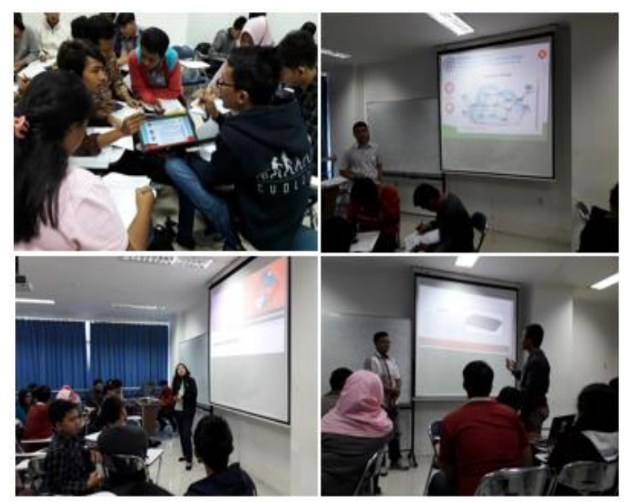
Figure 2. mDPBL teaching and learning environment.

Figure 1 depicts contents various feature of Computer Networks such as concept description and routing algorithm. The description of routing concept includes objective, kind of routing and benefit. While, forward search algorithm as one of the routing algorithm explained of the routing algorithm feature.