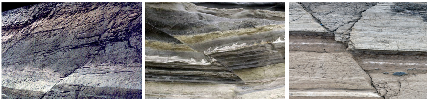
1. Normal fault

Students can also benefit when instructors state the correspondences explicitly. In a cross-national study, Richland, Zur, and Holyoak (2007) compared the use of analogies in classrooms in Hong Kong, Japan, and the U.S. The teachers in Asia explicitly stated the correspondences for analogies provided to students in math classes much more frequently than their American counterparts did. Similarly, learning from a model can be enhanced when instructors guide students while interacting with a model—for example, by making observations over time (Tolley & Richmond, 2003), predicting its behavior (Crouch, Fagen, Callan, & Mazur, 2004), or altering the model and observing the result (Gates, 2001). The Harrison and Coll (2008) guide to teaching with analogies provides a useful template for designing science analogies accompanied by several examples that can be used in middle and secondary school (although only a few geoscience analogies). In each case, the correspondences and inferences are explicitly given, as well as the disanalogous parts.