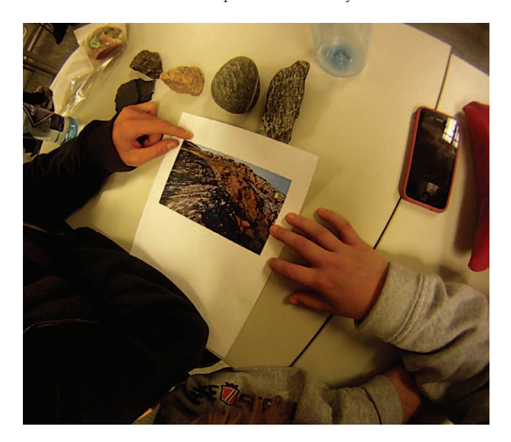
FIGURE 3: Posttask on understanding of relative dating. We gave the students a picture of crosscutting relationships in bedrock. Then, we asked the students, "Which is the oldest, and which is the youngest?" The aim was to illuminate the students' understanding of relative dating. The still photograph was taken from a headmounted camera, which recorded the students' reasoning while solving the task.

students solved the posttasks in pairs (6 students = 3 pairs) because we believed that their talk and behavior would provide us with a better insight into their reasoning than would have been possible if they had solved the