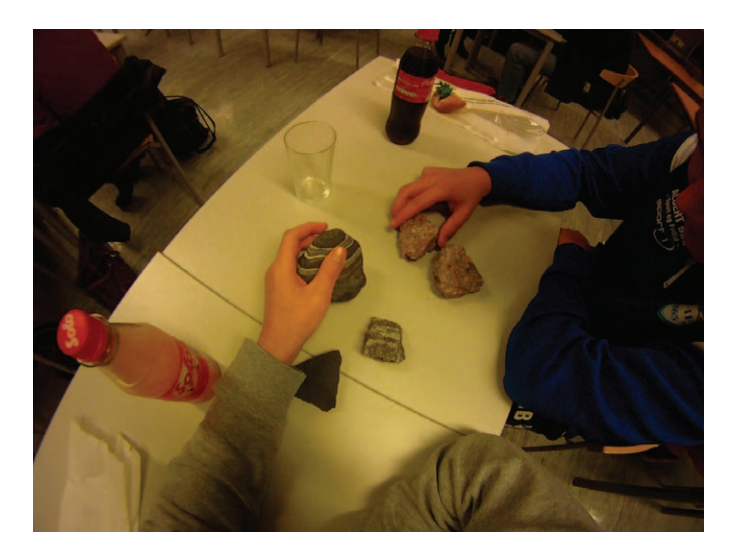
FIGURE 2: Posttask on understanding of rock identification. We gave the students five rock samples (one sedimentary, two metamorphic, and two magmatic). Then, we said to the students "Sort the rocks into the main groups." We did not specify the number of main groups or use geoscientific terms. The purpose was to investigate the students' understanding of rock identification. The still photograph was taken from a headmounted camera, which recorded the students' reasoning while solving the task.

students solved the posttasks in pairs (6 students = 3 pairs) because we believed that their talk and behavior would provide us with a better insight into their reasoning than would have been possible if they had solved the