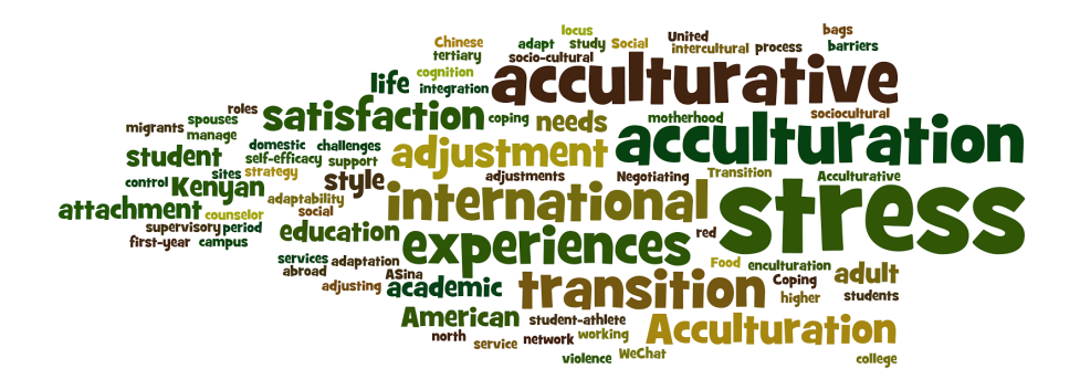
Figure 1: A Visual Representation of Acculturation Issues

Acculturation in the context of international students involves the cultural adjustment of international students by adapting to or borrowing traits from the culture of their host community including the host institution. This theme consisted of the dissertations that addressed key issues such as student life satisfaction and transitional experiences ranging from food to spouses, games to campus life, and other socio-cultural adjustment issues.