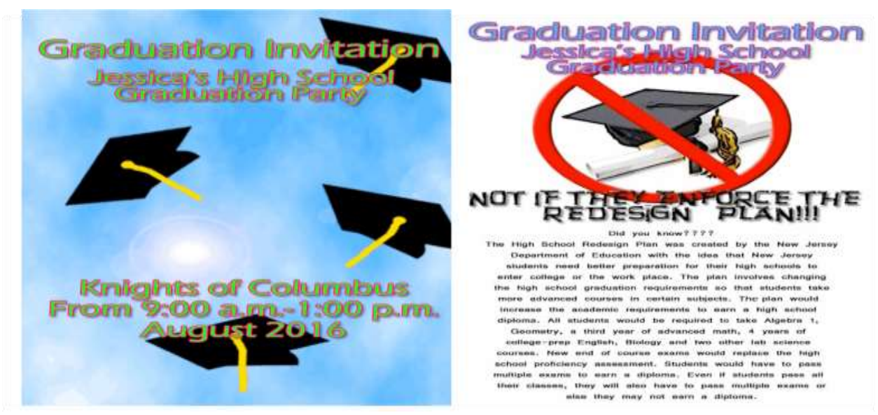
Figure 2 : Image created by youth researchers depicting an invitation to a high school graduation party.

Members of the NJUYRI built on their own creative expertise for a variety of local actions, which included film productions, skits, spoken word, and awareness postcards. In considering the potential impact of requiring multiple end-of-course exams for graduation in the daily life of a student and her family, one group from Paterson conceptualized a high school graduation party invitation shown in Figure 2.