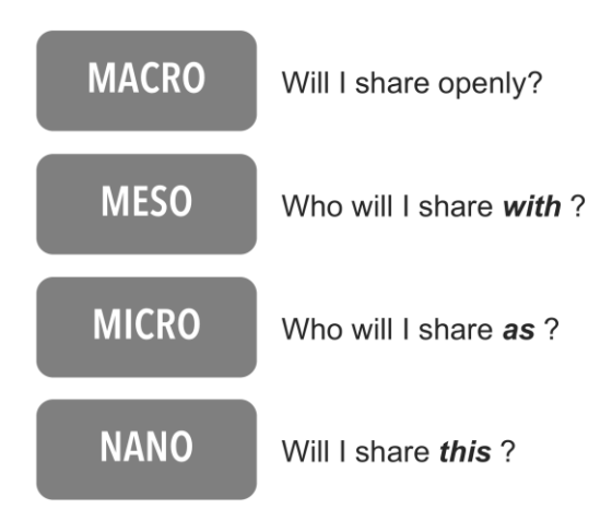
Figure 2. Considering openness at four levels.

At the macro level, individuals make decisions about whether or not to engage in open sharing and networking. Some opt out at this level, while those who engage in open practice must consider questions at three further levels. At the meso level, individuals consider whom they would like share with (e.g., family, friends, colleagues, students, community/interest groups, the wider public) as well as those with whom they do not want to share. At the micro level, individuals make decisions about their digital identities, i.e. who they will share as. And at the nano level, individuals decide whether to interact/share something particular: for example, post, tweet, or retweet; use a specific tag or hashtag; like, follow, or friend.