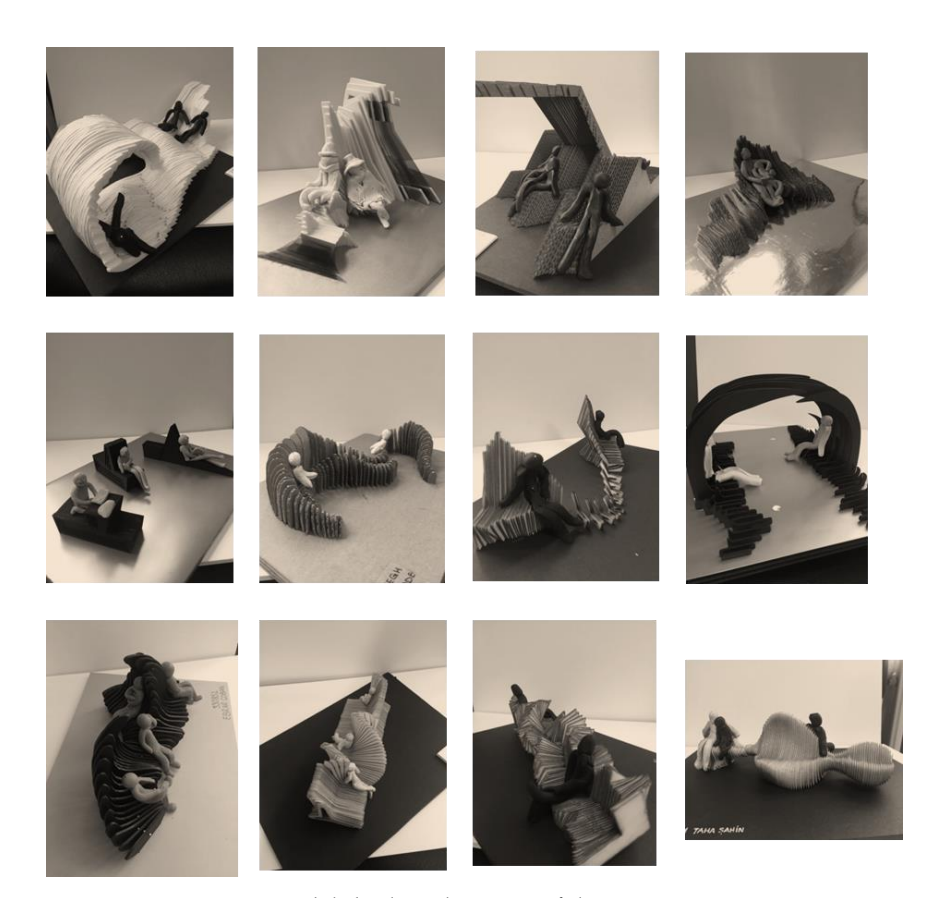
Figure 1. Seating unit models built in the scope of the course