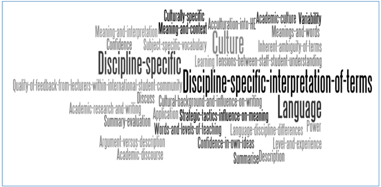
Figure 3: Word cloud of others' categories

As mentioned above, in an ongoing fourth stage of our exploration of these words, we take them to workshops and ask other lecturers to categorise the quotes from our focus group participants. We represent this here (Figure 3) as a word cloud (via wordle.net) to show the types of categories that have been generated.