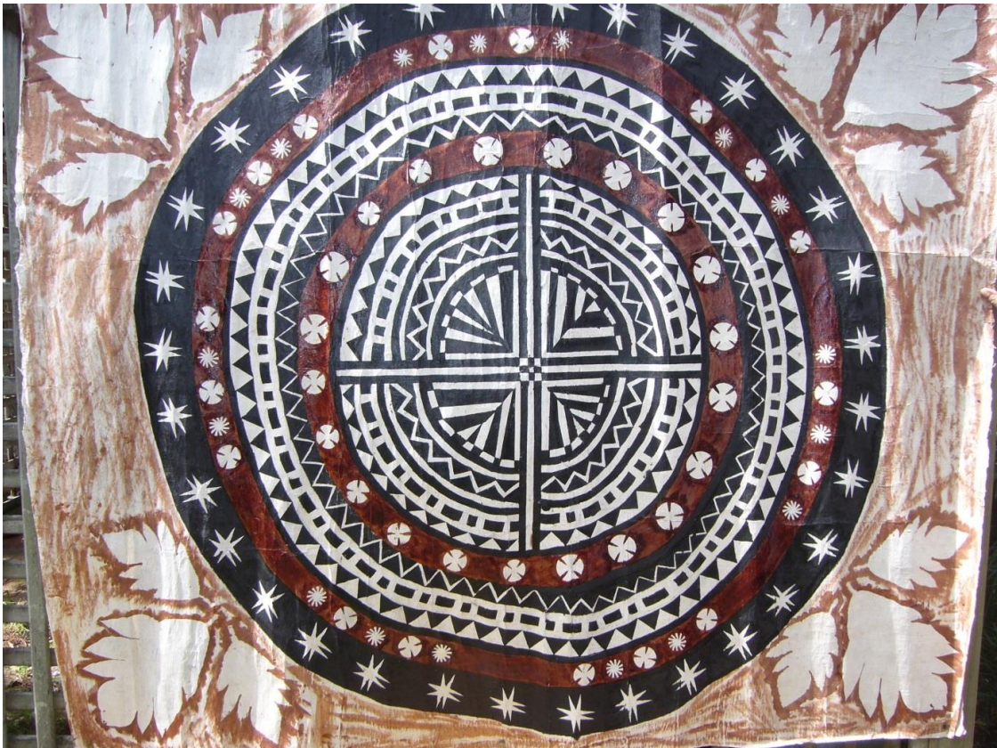
Figure 1: The Yaubuliti framework masi

The masi framework (Figure 1) I will now discuss is derived from masi patterning and motifs of the tokatoka (sub-clans) of Yautibi and Valebuliti in Natewa village. The overall design is called bolabola and a motif is called draudrau . The framework is called Yaubuliti 3 because the design, including a set of (four) motifs, are properties of the sub-clans, passed down through generations.