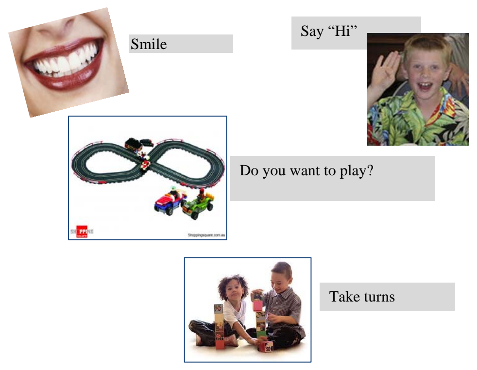
Figure 1. Example of poster prompts - visual prompts used after training session

Posters with visual prompts were used to teach the children each skill (see figure 1). These posters were used as prompts for the peers when attempting to play partners. Poster (visible reminders) hung on easels on the perimeter of the play area. Posters represented information provided to the peers during informational sessions.