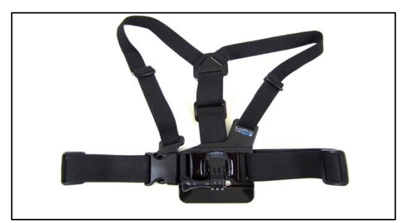
Figure 3: The GoPro Chest Mount