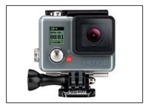
Figure 1: The GoPro Hero+ camera used within the study

Compared to the traditional use of digital video cameras that have been used to record, evoke and enact experiences, GoPro video cameras are uniquely designed for 'action packed' practical experiences by enabling 'point of view' vision when attached to parts of the body in high definition (Wellard, 2015) (Figure 1). It has been reported that such wearable digital video cameras have strong potential for researching social worlds (Chalfen, 2014). Such emerging technology can record action experiences and provide possibilities to capture embodied, sensory, kinesthetic and emotional knowledge and experiences (Wellard, 2015). The video cameras not only capture high definition video, yet are also match box sized and built to withstand substantial force (as illustrated by Felix Baumgartner's 18,000 mile high 'Space Jump') (Redbull Inc., 2012). With the 'action packed' nature of PE practical teaching classes, such technology can provide externally enrolled PE students with access to simulated learning via 'point of view' angles that are important during the practical classes.