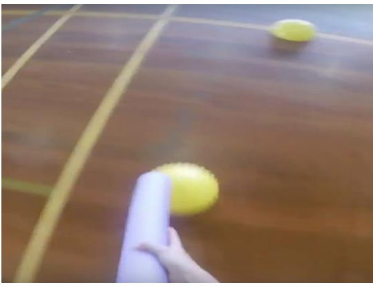
Figures 6 & 7: Simulated examples of pre-service teachers engaging in basketball (Figure 6) and modified hockey activities (Figure 7)

Primary PST# 12. "Visuals are fantastic as an external student. I felt a little closer to the learning environment."