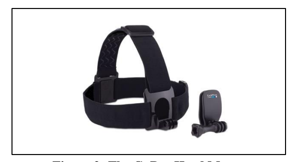
Figure 2: The GoPro Head Mount

The simulated practical experiences were recorded with the assistance of a head strap mount (Figure 2) and a chest strap mount (Figure 3). The GoPro Hero+ Edition camera was used for its suitability to combine high quality video with mobility of use (GoPro, 2010). Affordability also played a role in selecting this camera. The main concern was ensuring the camera had the correct video format to ensure functionality by recording the performance of practical PE class activities from a first person point of view (teacher or student), suitable for video editing and later for uploading into YouTube. The High Definition (HD) standard resolution of 1080 (1,920 x 1,080) was applied to the video recording settings to ensure the practical activities could be optimally captured (GoPro, 2010). The GoPro was also operated by a Smartphone with a GoPro application to preview and control the camera (start/stop the camera).