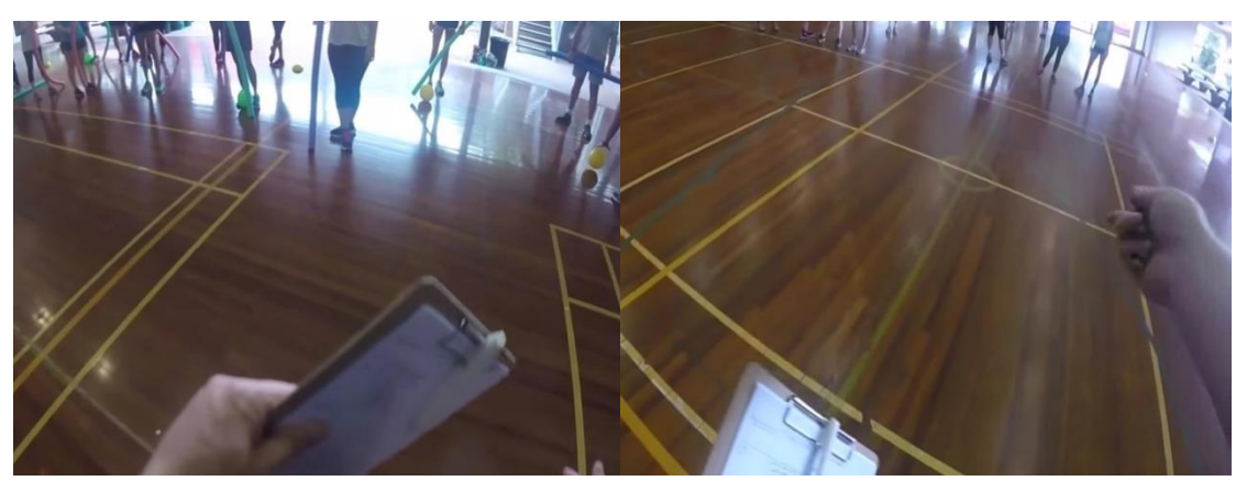
Figures 4 & 5: Simulated viewpoints of the facilitator instructing (Figure 4) and directing (Figure 5) activities

Primary PST #8 "In particular for students missing prac classes."