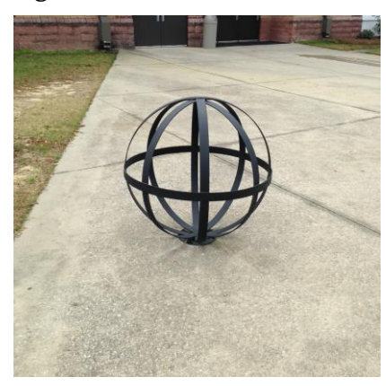
Figure 1 - IB related décor