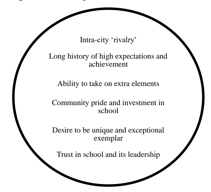
Figure 4 - Lived space at JMS