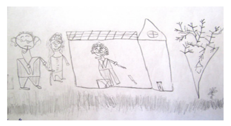
Figure 3. Not to forgive and killing the bride woman

A mouse did an ill turn to the other one and struggle with each other and this mouse stabs his dagger at the back of the other mouse. The mouse cries a lot and the other laughs and says that this is the respond of the evils you did to me in front of our house.