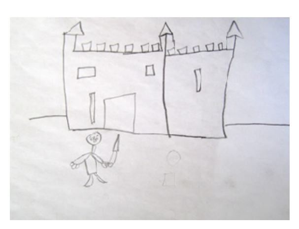
Figure 4. The story of the soldier and the castle

Once upon a time, a woman and a piping man became familiar and married each other and after their marriage, they were searching a house. The houses were expensive. The man thought with himself that I buy a house from my father-in-law and then kill the bride. The groom hadn't money. The bride's father was forced to borrow two hundred million for him to buy a house. Then they got married. The groom said to the bride: come to the room I want to say a private thing to you. He took the bride into the room and killed her by a sharp knife and then he cried and said: I didn't want to do this. I was forced. The next day, he sold the house and escaped and went to the airport and he was arrested there.